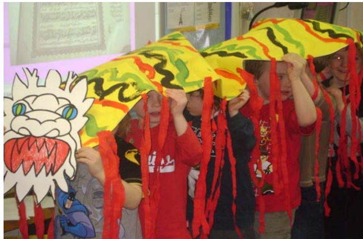
Class 1 and their Chinese Dragon